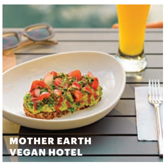
MOTHER EARTH VEGAN HOTEL