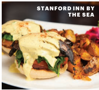
STANFORD INN BY THE SEA