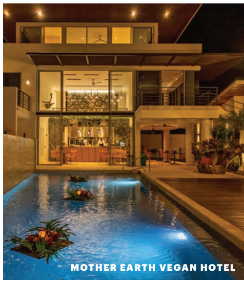
MOTHER EARTH VEGAN HOTEL